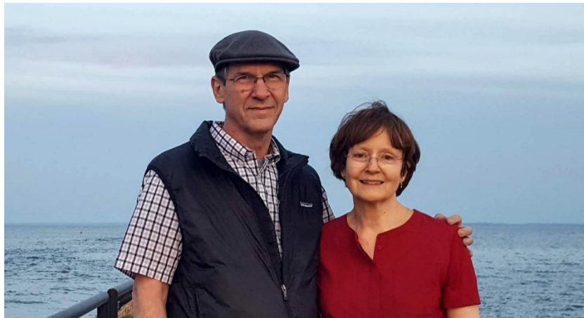
visiting Fairfield, Connecticut, June 2021